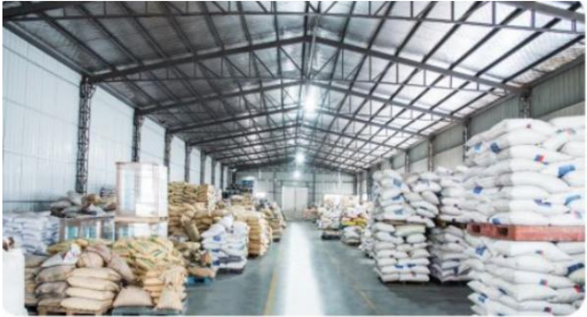
Raw material area