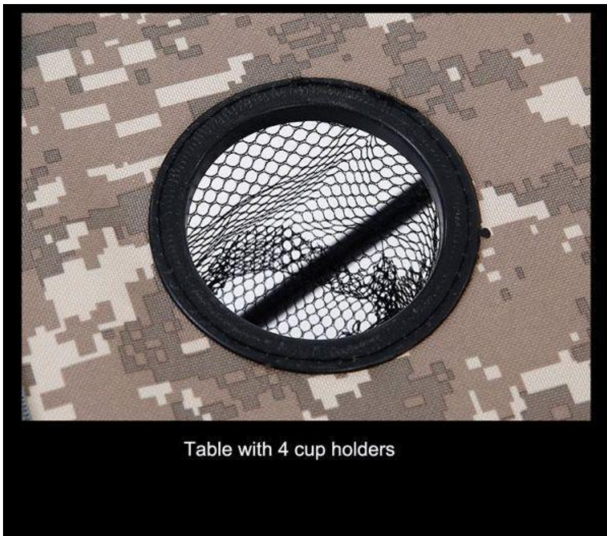
Table with 4 cup holders